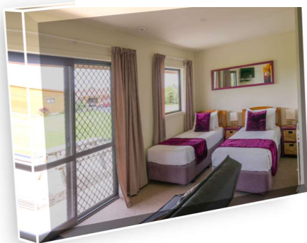
Garden Studio Twin

(Accommodates up to 3 people or 2 adults and 2 small children)