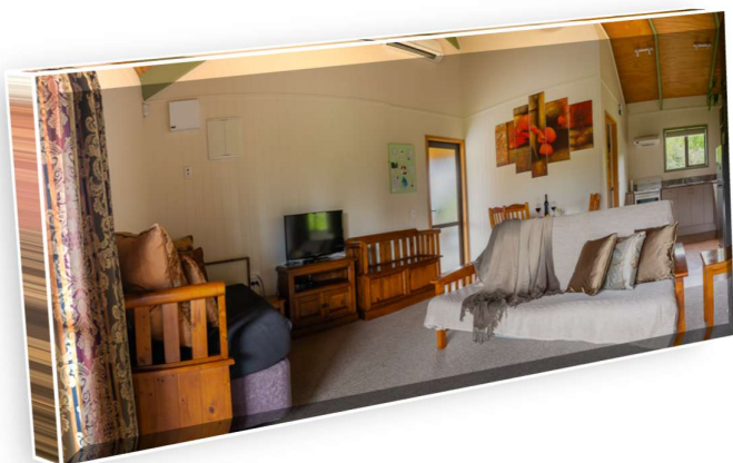
Two Bedroom Family Cottage (Accommodates up to 7 people)

Bedding configurations can be changed to suit your requirements.